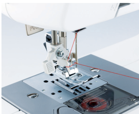
Easy Threading System