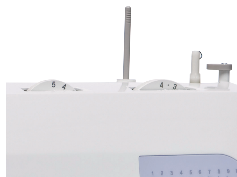
Stitch length and width control

Wide range of optional accessories available including quilting feet, etc. See your dealer or visit www.brother.com for details.