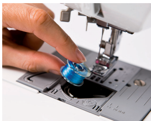
Quick set bobbin